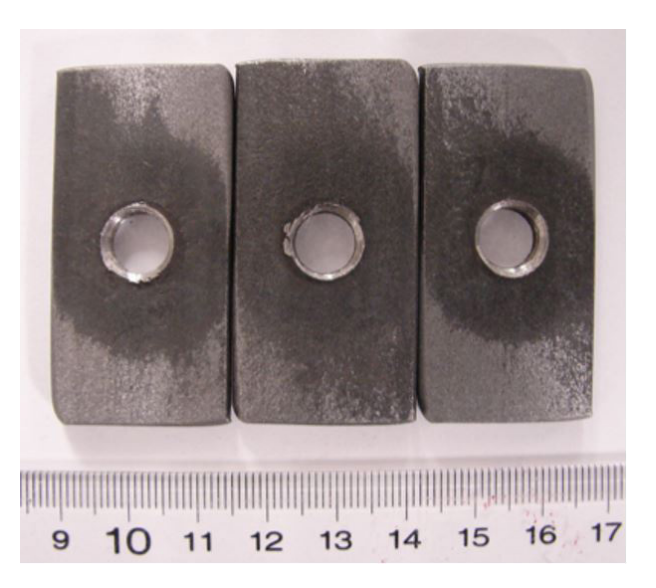
Figure 3. Plates used in LCPC tests of copper sulfide ore samples (from left to right: feed, concentrate, and tailings).

This study provided evidence that the LCPC test was effective in determining the abrasiveness of the feed and products of a copper sulfide ore pre-concentration operation. In addition to the well-known gains from pre-concentration processes in terms of reduced mass to be fed into the mill,